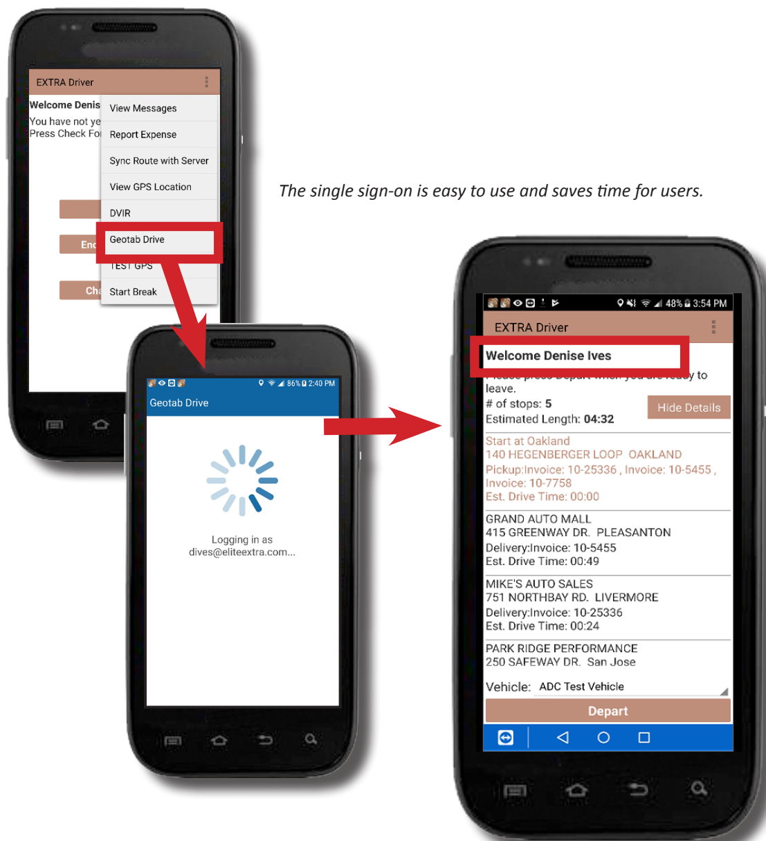
The single sign-on is easy to use and saves time for users.

Here are some real-life ROI examples from EXTRA users: